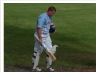
OH, THE PAIN!