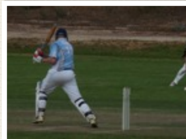
MUZZA ON THE ATTACK