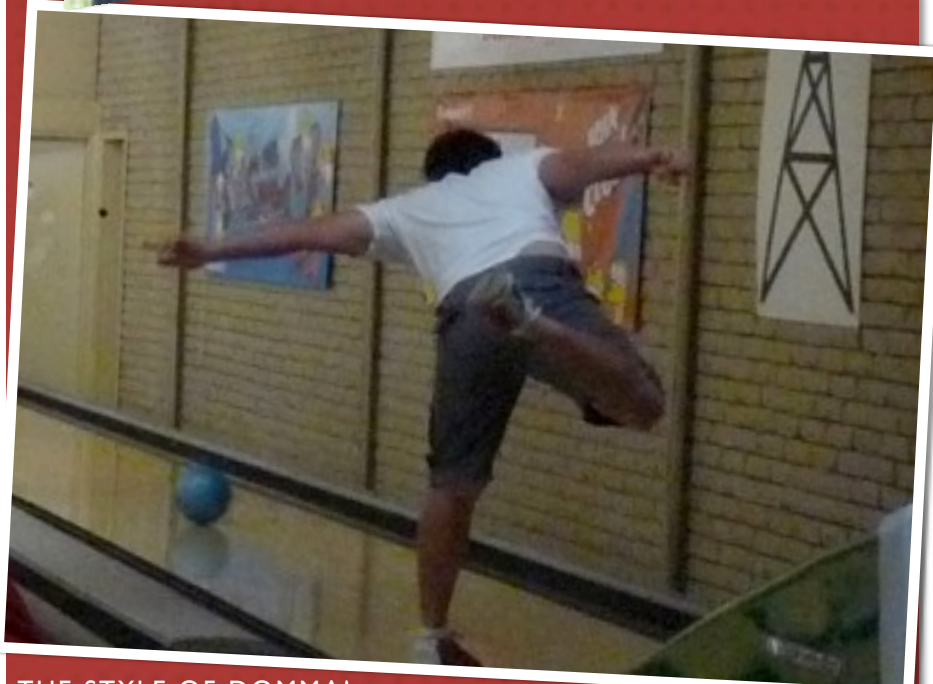
THE STYLE OF DOMMA!