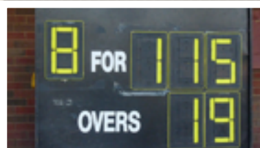
OUR SCORE AFTER 20