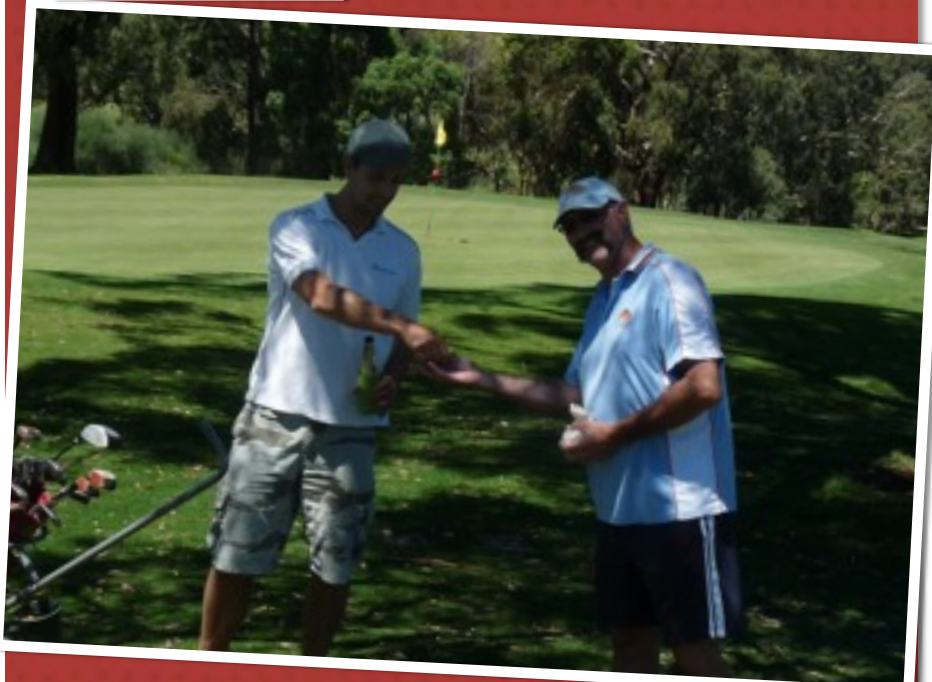
DEANO HANDING OVER HARD EARNED!