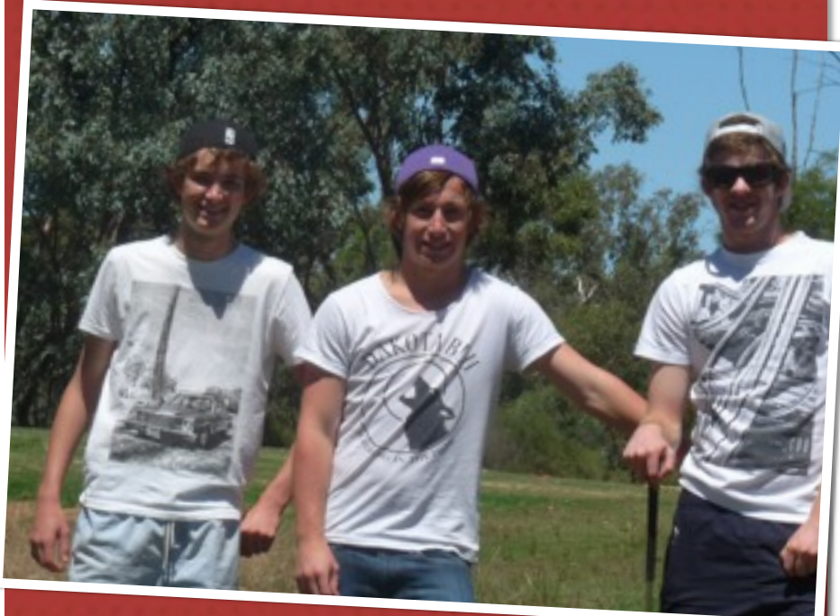
WHARTO, HEALS AND SMITHY ENJOY THE GOLF DAY!