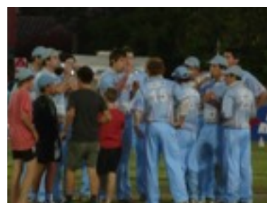
CELEBRATING A WICKET