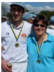
The Prowses were extremely happy after the B Grade Grand Final

We all hope to enjoy our last get together for the season and celebrate a successful season.