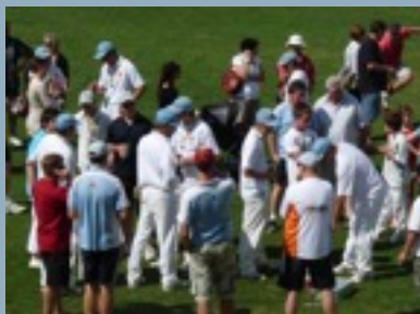
In the aftermath of the B Grade Premiership at Eaglehawk

The team finally won by about 20 runs! Congratulations to all involved!