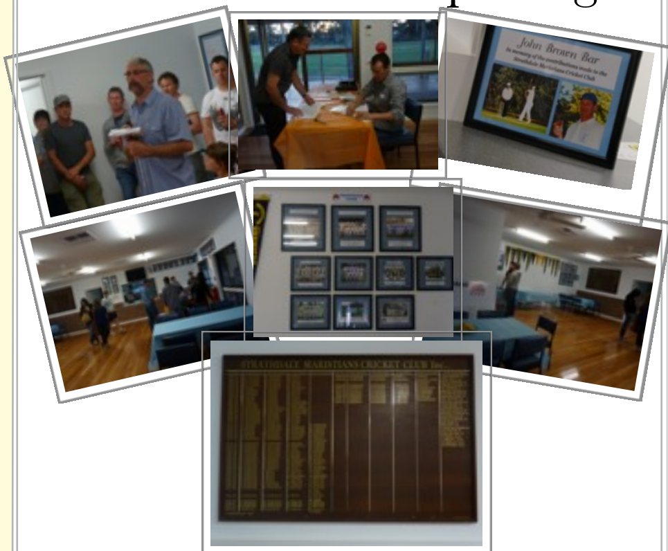
Some of the images of the opening of our new clubrooms