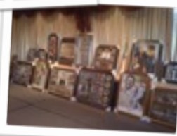
Major events are the golf day and Trivia Night