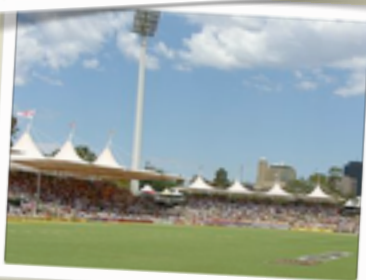
The Gabba, Queensland