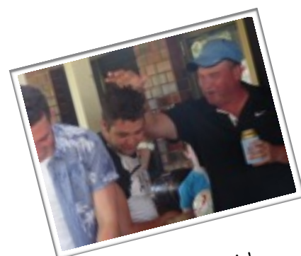
... to this!