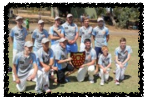
Fig 3: To the victors go the spoils!