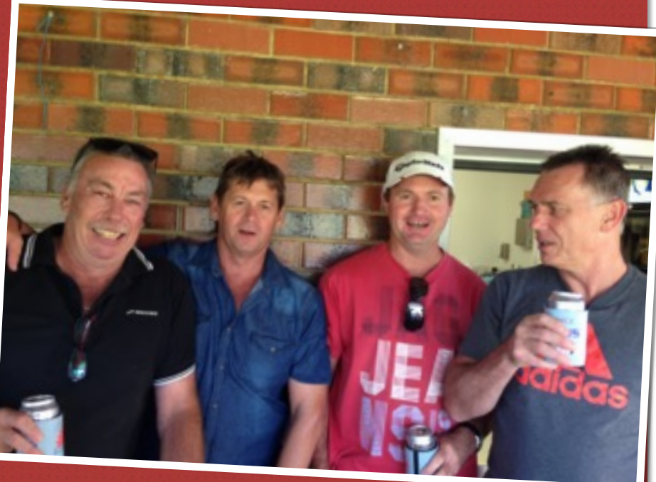
THE WINNING $1000 DRAW SYNDICATE