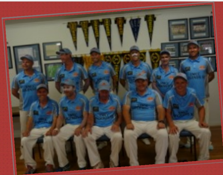
THE 20 YEAR REUNION TEAM - THE LEGENDS