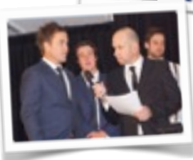
More images from the 'Rising Suns' Launch