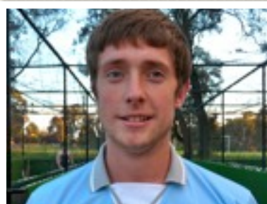
ASH (THE POM)