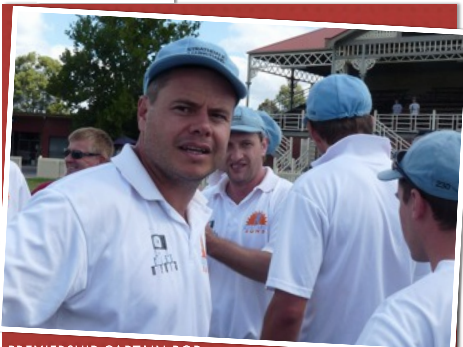
PREMIERSHIP CAPTAIN BOP