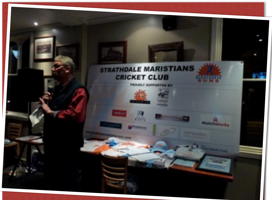
SPONSOR'S NIGHT - OUR PRESIDENT SPEAKS!