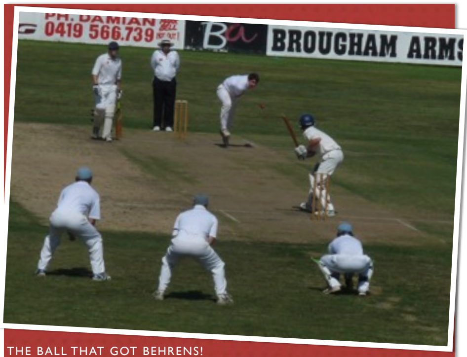
THE BALL THAT GOT BEHRENS!