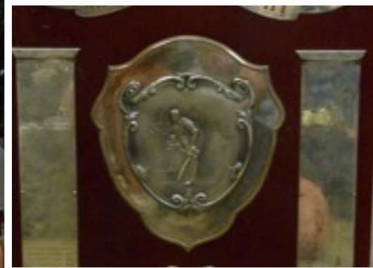
The Sir John Leinhop Trophy belongs to the outstanding team of 2010/11 - Strathdale Maristians Cricket Club!