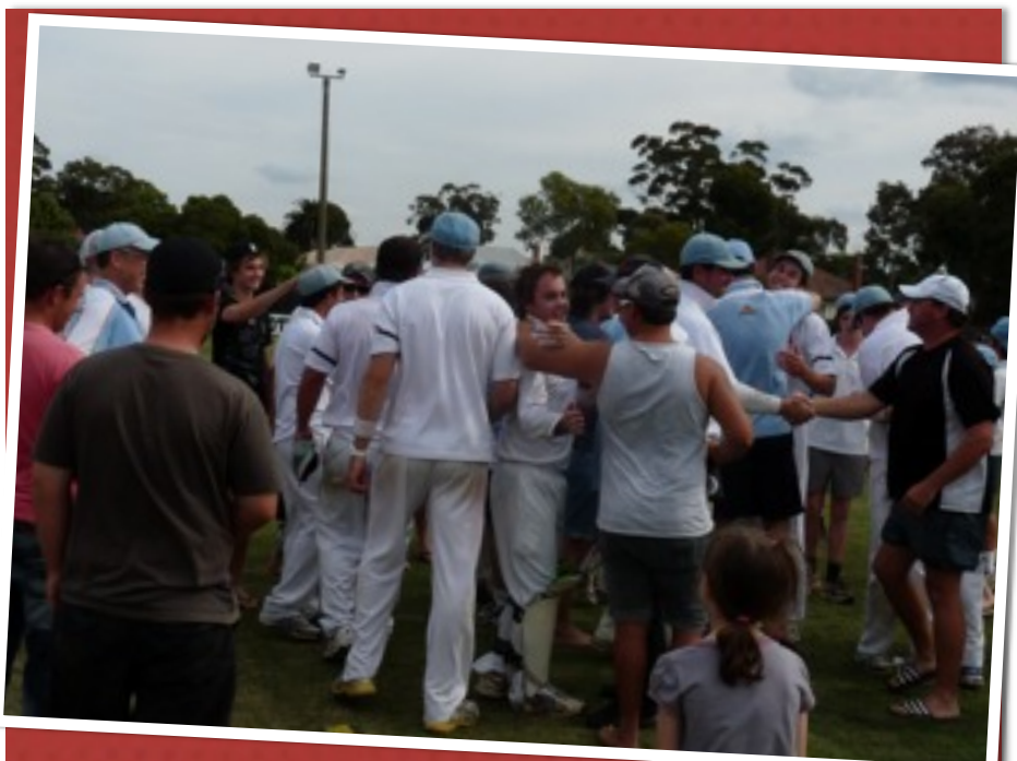
THE MINUTES AFTER THE GAME