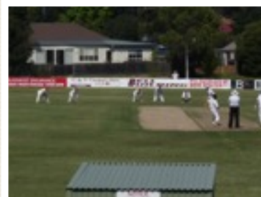
THE SCENE AT HARRY TROTT OVAL