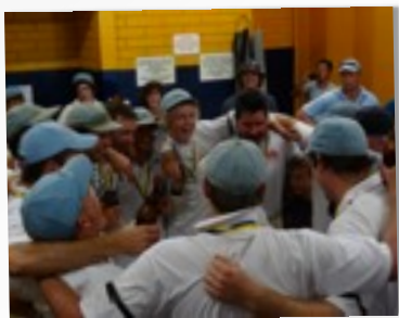
THE PLAYERS SINGING THE SONG AFTER THE GAME!