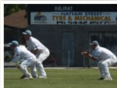
READY FOR THAT CATCH