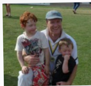
OUR ONLY CURRENT DOUBLE PREMIERSHIP PLAYER WITH GREATEST FANS!